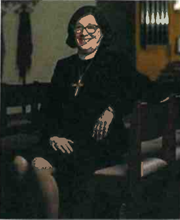
Presiding Bishop Eaton